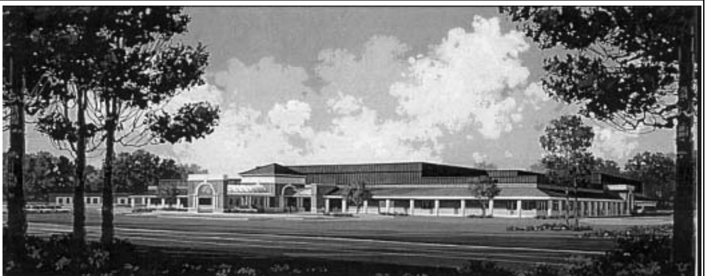
Wayne County High School

I'm looking forward to seeing you at the Annual Conference! ▲