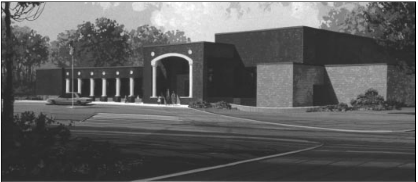
Adrian School for the Performing Arts

But until then, we still have much work to do together. I would also like to thank all of you who have expressed your support to me during this time of transition. ▲